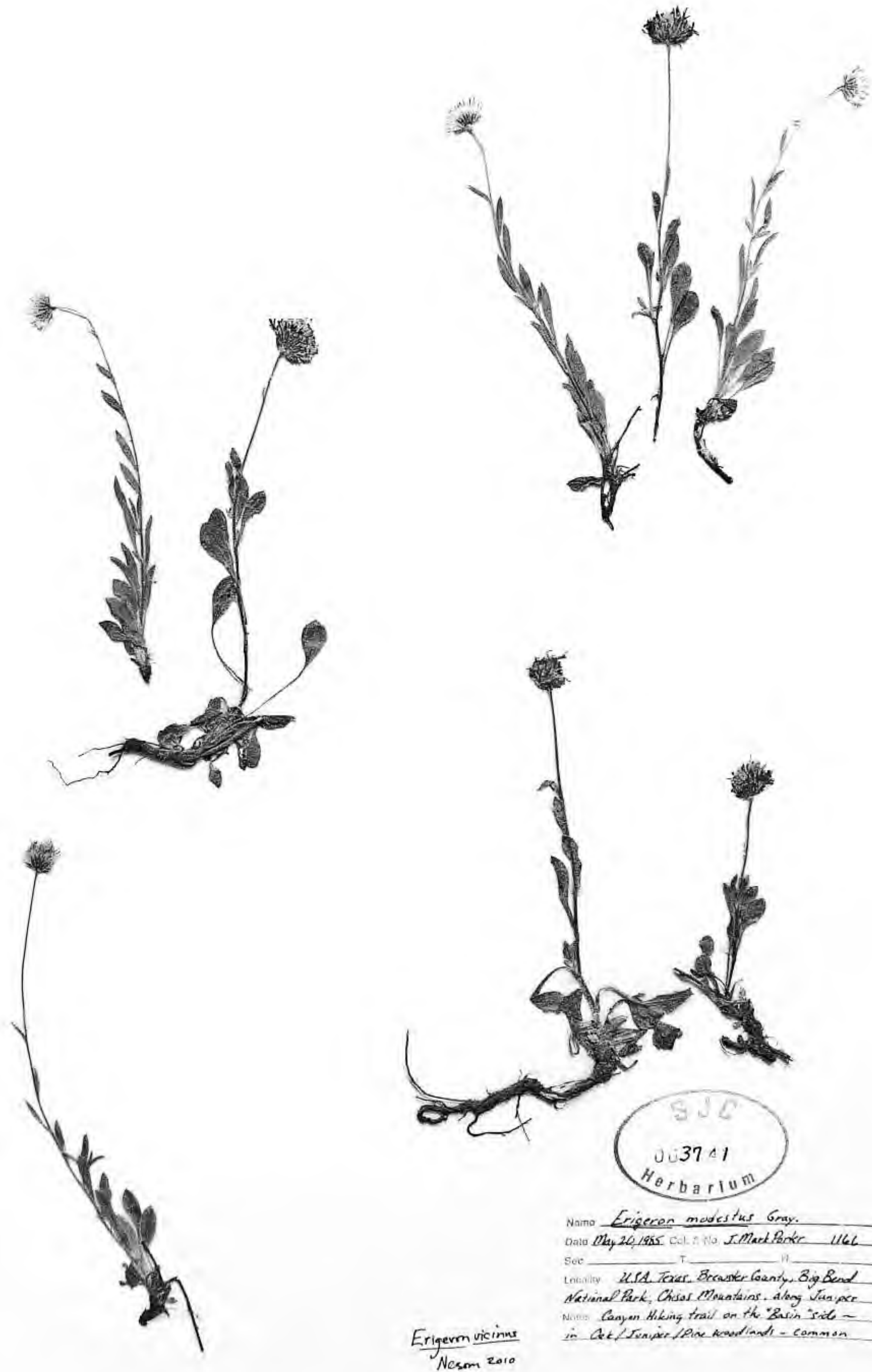
Figure 2. Erigeron vicinus from Brewster County, Texas (Porter 1166).